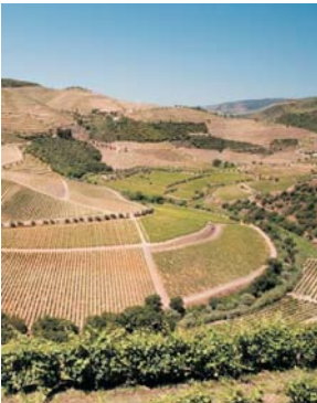
QUINTA DAS LAGES

The Graham's 2011 Vintage Port has been made from these five Graham's Quintas. All grapes were picked by hand and fermented in lagares (treading tanks). The total production in 2011 of the five Quintas was 1,454 pipes (799,700 lts) of Port. Charles Symington and his cousins have selected just 131 pipes (72,000 lts), i.e. 8,000 cases, after months of exhaustive tastings, to bottle as Graham's 2011 Vintage Port. The Graham's 2011 Vintage Port is from the very best wines made at these different Quintas, and represents just 9% of the entire production of the five Graham's vineyards.