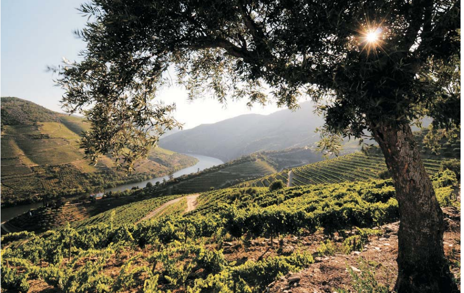
QUINTA DOS MALVEDOS