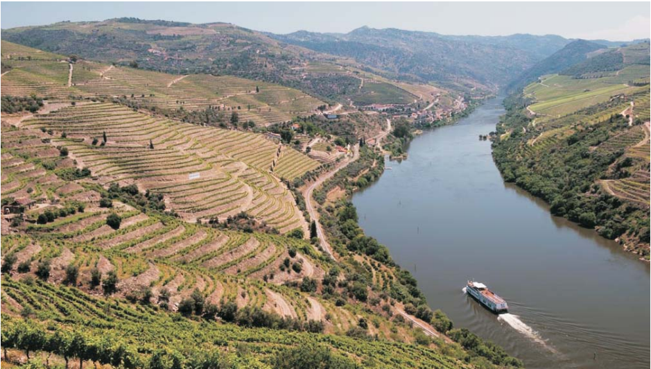
QUINTA DOS MALVEDOS AND QUINTA DO TUA