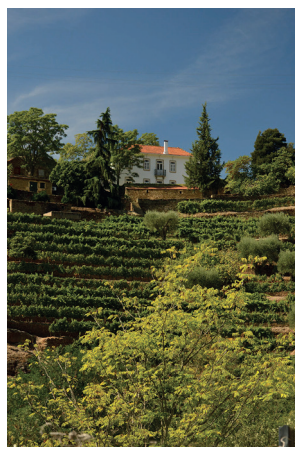
VINHA DOS CARDENHOS

This Stone Terraces release represents less than 2% of the production of the Quinta dos Malvedos estate in 2016.