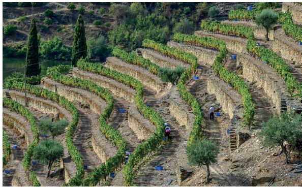
THE 'PORT ARTHUR' STONE TERRACES AT QUINTA DOS MAI VEDOS

been abandoned in the aftermath of phylloxera, were reconstructed by hand, recovering the sturdy retaining walls to create terraces, with minimal disturbance of the schist bedrock. A vine planted under these conditions is naturally stressed, having to put down deep roots through cracks in the schist to find the necessary water with which to survive the typically hot and dry summer of the Douro.