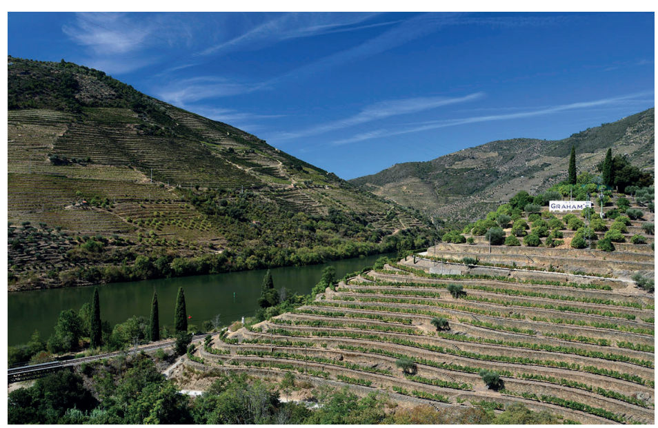
THE PORT ARTHUR VINEYARDS CATCH THE MORNING SUN