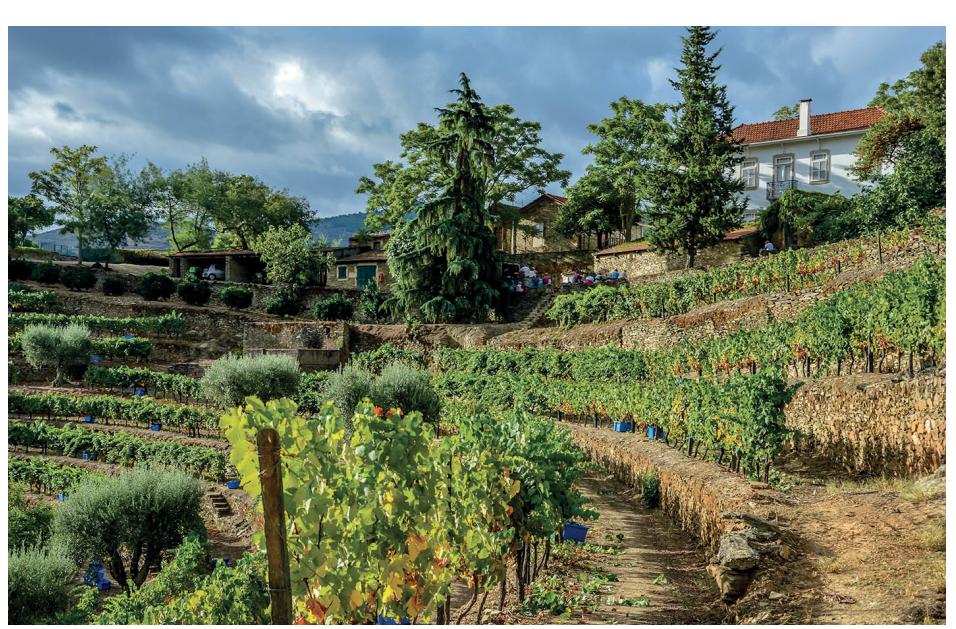
THE AMPHITHEATRE-SHAPED VINHA DOS CARDENHOS STONE TERRACES AT MALVEDOS

The pickers started on the northeast oriented Cardenhos section of the stone terraces, a diminutive (0.6 ha) amphitheatre-shaped vineyard behind the Quinta house, and gradually worked their way around the ridge on which the latter is built to harvest the 1.2 ha 'Port Arthur' vineyard, whose 1,379 vines face due east. While 'Port Arthur' produced concentrated wines of impressive structure, reflecting its greater exposure to sunlight, Cardenhos delivered delicate, balanced wines with wonderful finesse. Touriga Nacional is the predominant