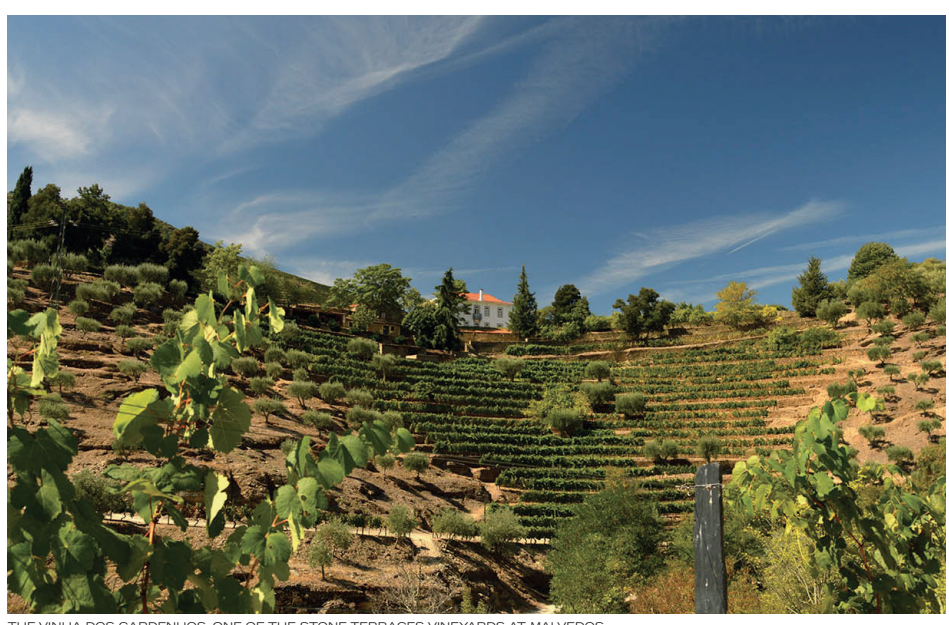
THE VINHA DOS CARDENHOS, ONE OF THE STONE TERRACES VINEYARDS AT MALVEDOS