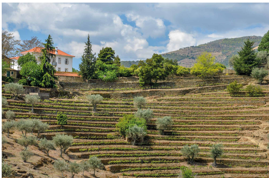
THE CARDENHOS VINEYARD, BEHIND THE HOUSE

The 'Cardenhos' Stone Terraces, which form an amphitheatre behind the quinta house are northeast facing and the Port Arthur terraces, around the ridge on which the house stands, face east. This is in complete contrast to the predominantly south-facing vineyards which make up most of the Malvedos vineyard. The Stone Terraces cooler orientations came into play in this extraordinarily dry and