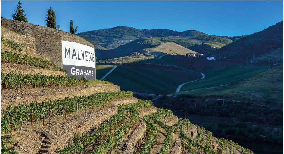
THE STONE TERRACES AT MALVEDOS

A relatively rare phenomenon in the Douro today due to their prohibitively high construction and maintenance costs, these schist-walled terraces, with their unique ability to store the sun's daytime heat through the nocturnal hours, bring considerable benefits in the final stages of ripening.