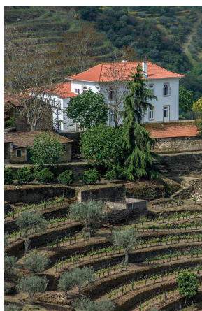
THE CARDENHOS VINEYARD

Extraordinary scents of orange blossom and rockrose, with notes of pine needles and bergamot in the background. The palate is opulent and seductive, revealing mesmerising concentration and incredible intensity without detracting from the wine's exceptional structure and balance. Very fine acidity provides remarkable freshness, which reflects the cooler east and northeast facing stone terraced vineyards at Malvedos. This wine has to be tasted to be believed.