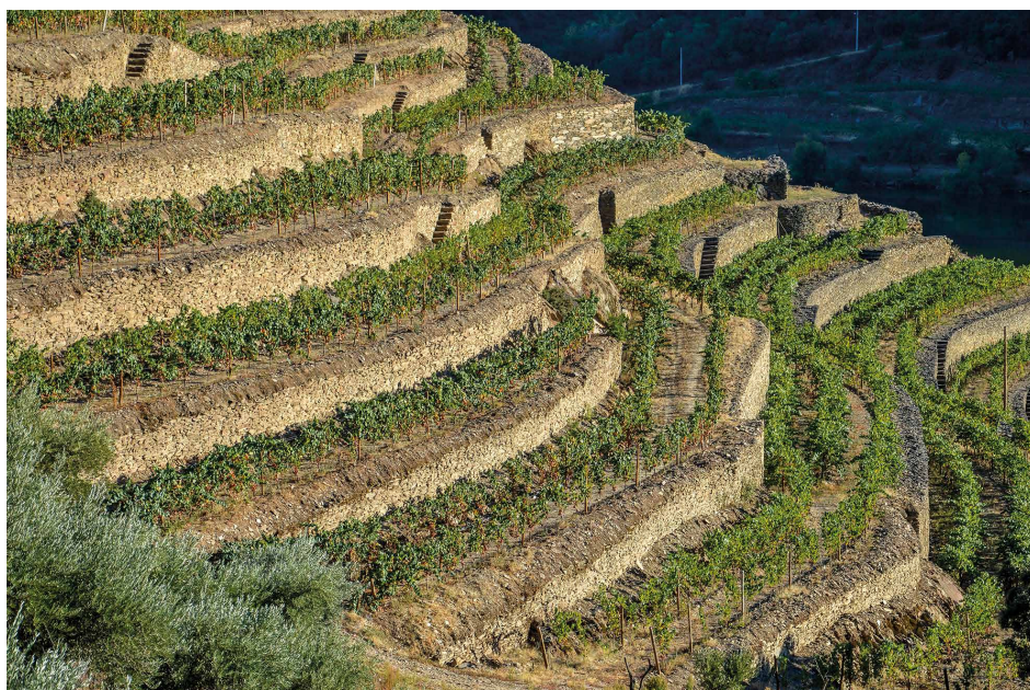
THE IMPRESSIVE STONE TERRACES AT MALVEDOS