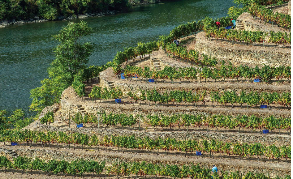
PARCEL 43 OF THE 'PORT ARTHUR' STONE TERRACES